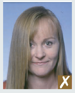
hair across eyes