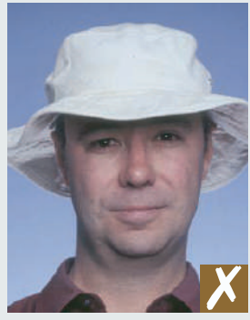
wearing a hat