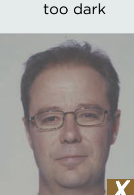
washed out colour

Photographs taken with a digital camera must be high quality colour and printed on photo-quality paper.