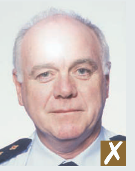
flash reflection on skin