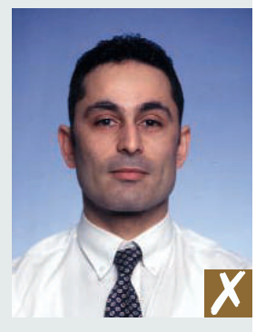
too far away